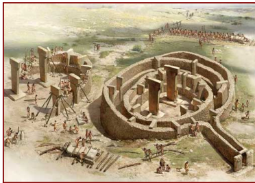
An artist impression of how G-T might have looked at the time.