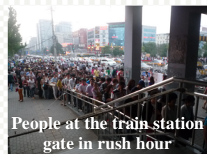
People at the train station gate in rush hour