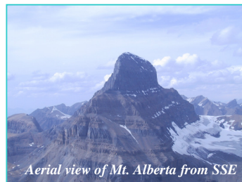
Aerial view of Mt. Alberta from SSE

The crux of their climb was a 4-meter over-hanging cliff which required an unusual maneuver to get by. One climber was tied to the wall