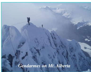
Gendarmes on Mt. Alberta

At first it seemed the expedition would not even get started because of forest fires burning in the Athabasca valley. Undeterred by this, the expedition left Jasper on July 11th with 9 climbers, 5 wranglers and 39 horses. As they approached the burn site, the wind changed direction allowing them to advance upstream despite being showered with ashes. Later that evening they got their first glimpse of the mountain which loomed through the smoky darkness like a gothic cathedral.