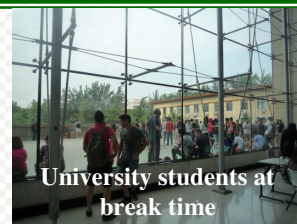
University students at break time

Usually around rush hour, especially on weekends, there are so many people. A lot of people make a big queue in front of the train station. It made me exhausted! In spite of such conditions, I kept going on small trips to nearby parks.. ... TO BE CONTINUED