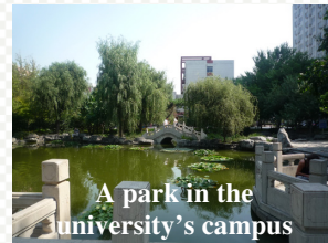
A park in the university's campus