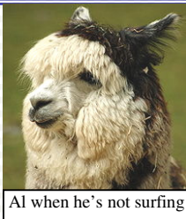
Al when he's not surfing

Meet Al. Al is an Alpaca from Peru. He and his kind are natives of South America. They can be found throughout the Andes, including Bolivia and Ecuador as well as Peru.