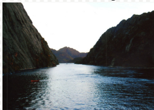
A Fjord in Norway