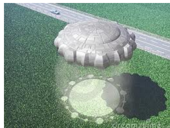
Is this how it's done?

Probably the most shocking and interesting crop circle occurred on Tuesday 21st of August, 2001 when two crop "squares" appeared right next to the SETI radioscope in Hampshire, the county next to Wilshire which contains Stonehenge! This crop square appeared to be a response to a message that the same radioscope sent into space in 1975. The response was decoded easily as it was sent in "binary" form (computer language 010101 etc.) and was found to be in English! The code reads: "Beware the bearers of FALSE gifts & their BROKEN PROMISES. Much PAIN but still time. BELIEVE. There is GOOD out there. We oppose DECEPTION. conduit CLOSING.!" The second square contained what looks like an image of the sender(s) of the message!