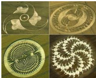
Some Crop Circles

Most crop circles are formed at night, though some have been seen to be formed during the day. They often form within three or four hours and there is very often no evidence of any "trampling" by people in or around or leading to the circles. Some crop circles are so big, up to a thousand metres long, that it is claimed that it would take hundreds of people more than 8 to 12 hours to make and these would look "crude" at best.