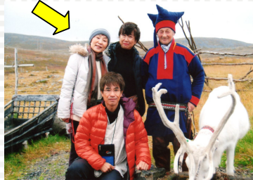
Laplander and his reindeer