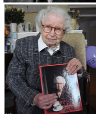
Bottom Left: Miep Gies, who found Anne's diary and gave it to Otto who then published it.