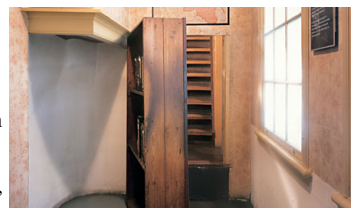
Right: The "Secret Annex"