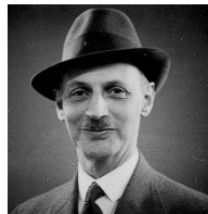
Top Left: Anne's father, Otto.

There are some YouTube videos about Anne Frank: http://www.youtube.com/user/AnneFrank