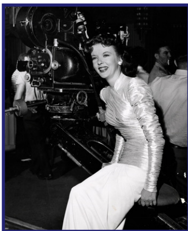
Ida Lupino on the set of The Man I Love (1946)

They Drive By Night (1940) and High Sierra (1941) – both starring Humphrey Bogart – are characteristic of her early acting work. She plays strong, ‘hard-boiled’, women and her intelligence and passion complement Bogart’s tough-guy persona perfectly. As a director, Lupino continued to favour projects that explored women’s role in society (often disparagingly labelled ‘women’s pictures’) tackling such subjects as rape, adoption, bigamy and unwanted pregnancy. Outrage (1950), The Bigamist (in which she also starred) and The Hitch-Hiker (both 1953) are notable examples of her directoral style.