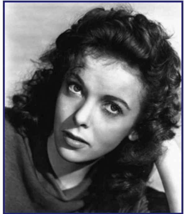
Actor/Director Ida Lupino

Ida Lupino was referred to as ‘Mother’ on set and had ‘Mother of us All’ embroidered on the back of her directing chair. It would be no exaggeration to say that Ida Lupino is – for many women filmmakers – a kind of spiritual mother.