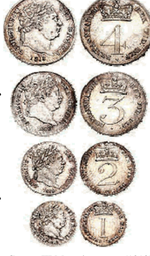
George III Maundy money (1818)

and 4 penny pieces — have been minted. Before then, ordinary coins were distributed. The monarch's head appears on one side of the coins but the design of the reverse side has remained almost unchanged since 1822. The coins are made of sterling silver (92.5% silver).