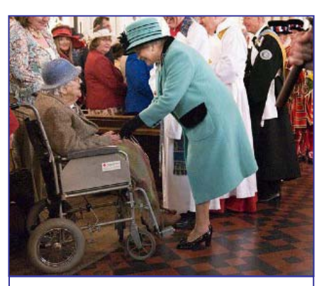
The Queen handing out Maundy money

II (1633–1701) the monarch washed the feet of the selected poor people in memory of Jesus' washing of the feet of his disciples at the Last Supper. The ceremony dates back to at least the reign of Edward I (1239-1307), possibly as early as AD600.