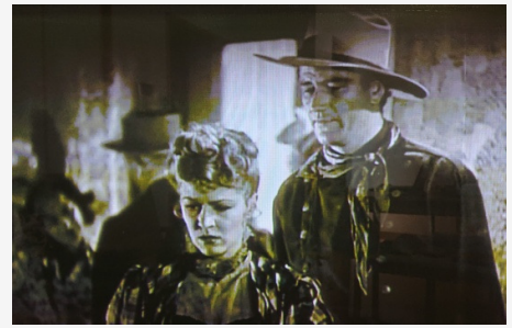
Ringo(Wayne) and Dallas(Trevor)

If you like western movies (or even if you don't), you will like Stagecoach , an American monochrome film released in 1939. In the story, seven strangers board a stagecoach and traveled together. The party consisted of two ladies (a pregnant woman and a prostitute) and six gentlemen (a doctor, a banker, a gambler, a whiskey salesman, a sheriff, and a driver). On their way from Arizona to New Mexico, they pick a man up, Ringo Kid (John Wayne), a fugitive who had escaped from a prison to take revenge on a gang who had murdered his father and brother.