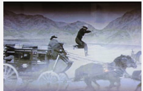
Ringo Kid jumps onto the horses

In Roseburg, Ringo asked sheriff Curley (George Bancroft) to give him ten minutes so he could do battle against the gang's brothers. It was three against one, but the tough guy won. Ringo was then arrested. He had to go back to jail. He got on a wagon and said goodbye to Dallas. However, Curley and Dr. Boone let Dallas board the wagon with him and they escaped together.