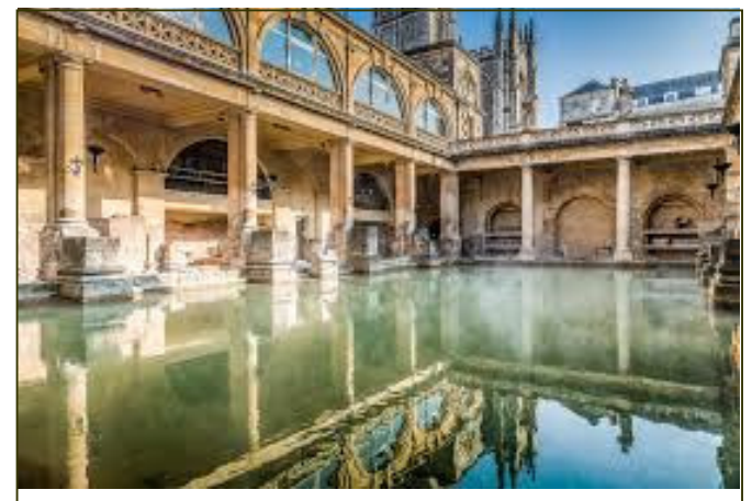
And finally, the Roman Baths!

Tourists are especially drawn to the Roman Baths which give Bath its name. The presence of a hot spring gave rise to a public bath-house, much like Dogo Onsen.