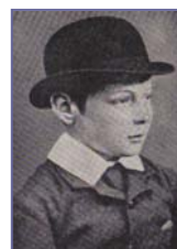
Churchill at age 10

And, who was the nobleman? His name was Lord Randolph Churchill. His son, Sir Winston Churchill!